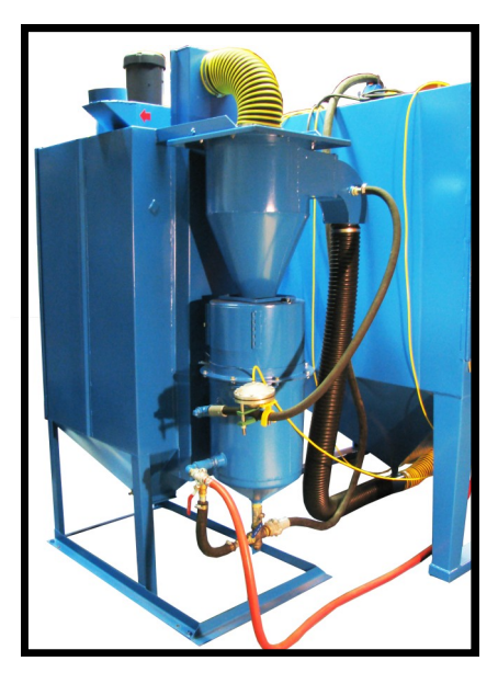
Aboytes Mfg. Cyclone Vortex Reclaiming Systems are designed to keep abrasive media free of contaminants while minimizing media waste.